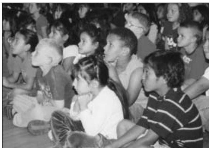
Students at Van Buren in Caldwell enjoy the Mariachi Sol de Acapulco. All artists who present in the schools remark on the good listening skills of area students.