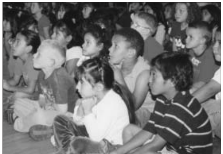
Students at Van Buren in Caldwell enjoy the Mariachi Sol de Acapulco. All artists who present in the schools remark on the good listening skills of area students.