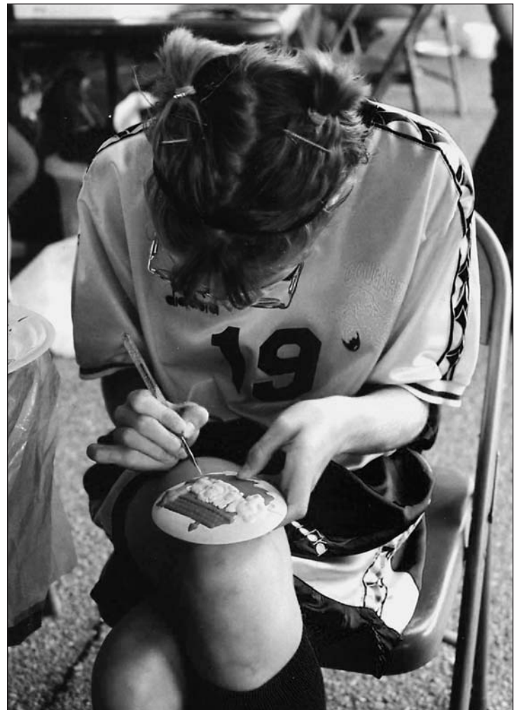
Indian Creek Festival 4-H Activities Tent featured ceramics that appealed to high school students too.