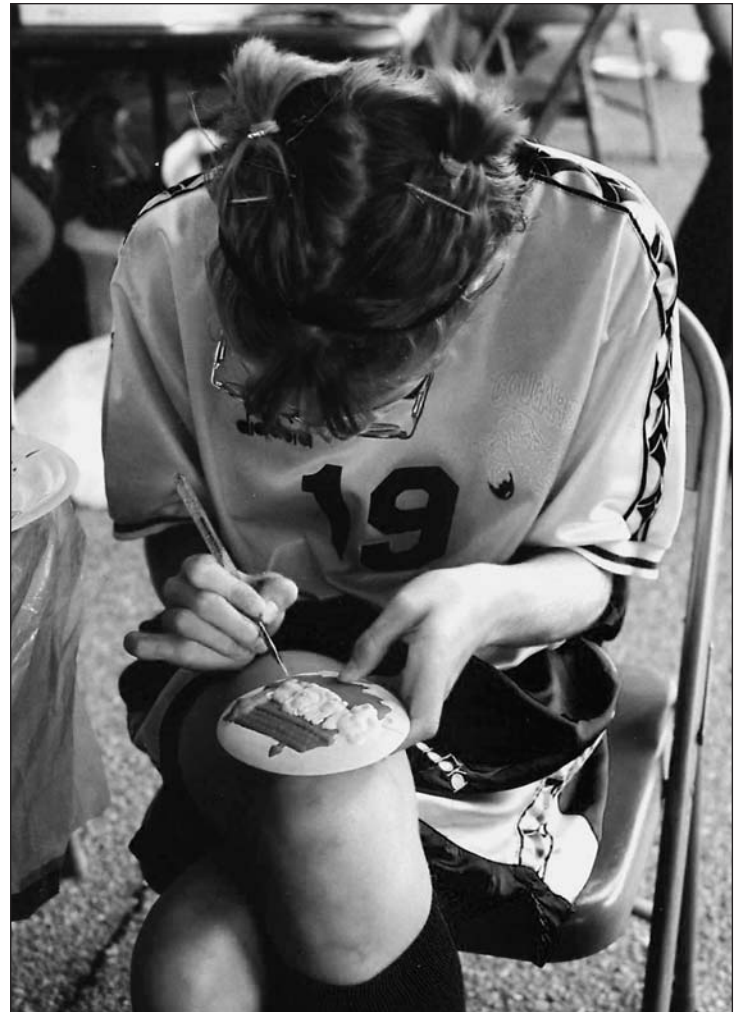
Indian Creek Festival 4-H Activities Tent featured ceramics that appealed to high school students too.